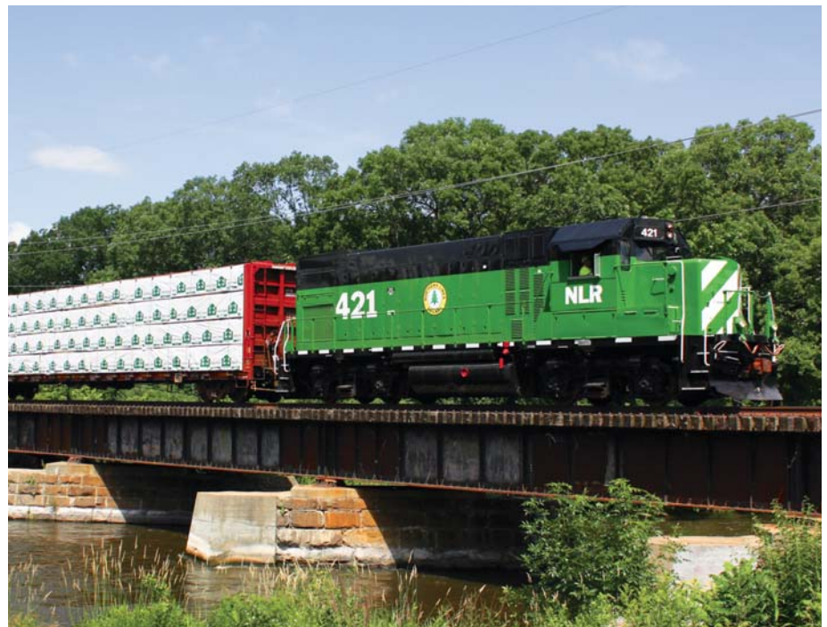
NLR #421 crosses the Sauk River in Waite Park, MN.