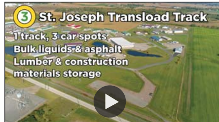
3 St. Joseph Transload Track 1 track, 3 car spots Bulk liquids & asphalt Lumber & construction materials storage