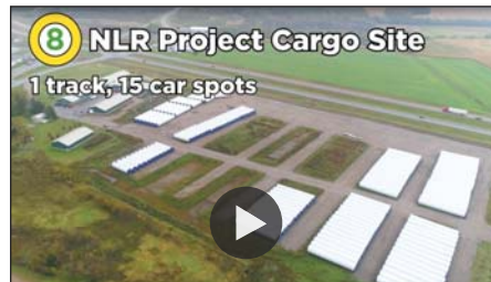
8 NLR Project Cargo Site 1 track, 15-car spots