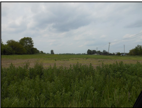
View of site north from Tracy Road