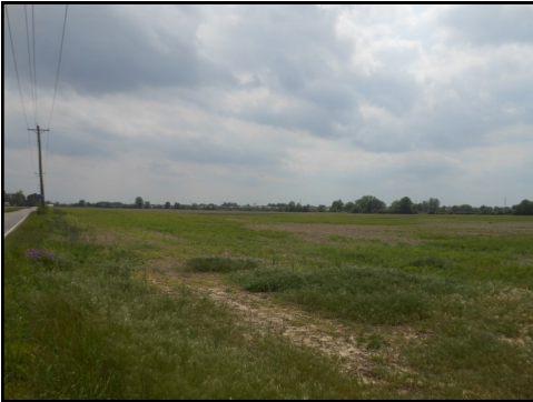
View of site south from NE corner