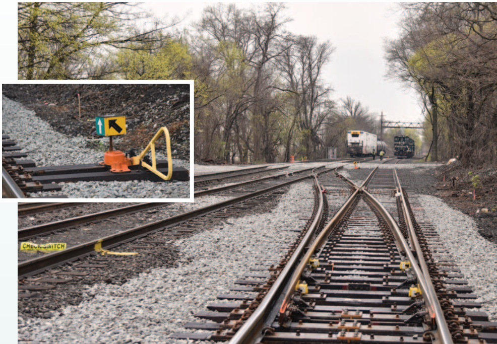
Longer interchange track increases operational efficiency.

A major improvement at our primary interchange location has created more capacity and greater operating flexibility. The “5 Main to 1 Iron Connector” (named for the tracks involved) project added 1000 feet of track and five new turnouts to expedite the interchange of traffic with CSX and the Providence & Worcester Railroad.