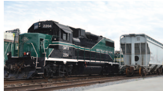
Each railcar NYA delivers carries the equivalent of four truckloads.

PTL—formed in September 2019 by Anacostia Rail Holdings Company and Brown Brothers Harriman Capital Partners Opportunities Fund, L.P.—operates 24 rail-served transload terminals in 15 states.