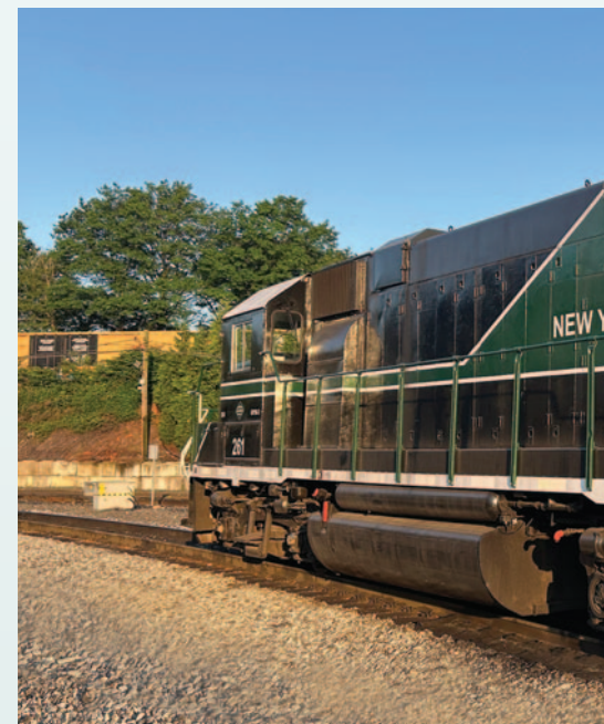
NYA 261, a GP38-2 locomotive, is the latest unit to be completed.

The rebuild program includes extensive upgrades to cabs, rebuilt