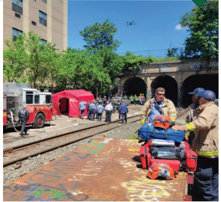
June's emergency drill with LIRR and several agencies (left) included full-scale exercises, and our West New York tunnels (right) served as an ideal training location for FDNY in May.