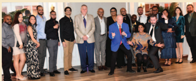
NYA employees at the annual Holiday Party