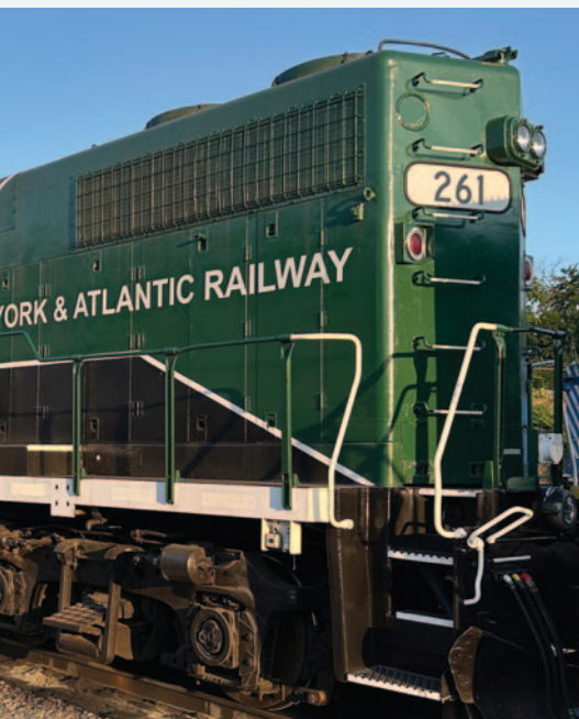
Completed in our multi-year rebuild program.

In addition to managing the internal NYA mechanical quality process, Beaubien also is responsible for oversight of car repair contractors. ♦