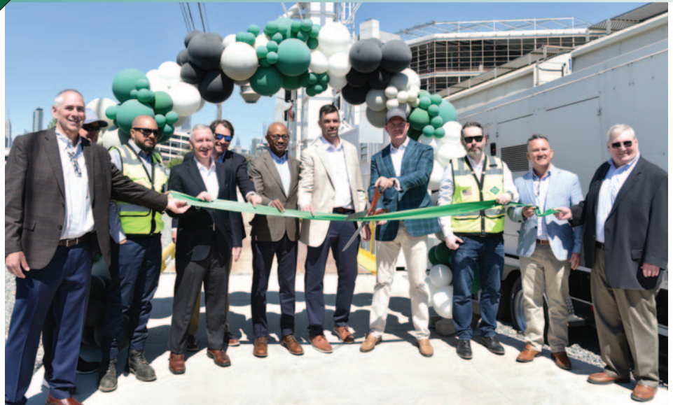
Reduced emissions and highway congestion are anticipated with the opening of Eco Material's Blissville Terminal, operated by Anacostia's Precision Terminal Logistics and directly served by NYA.